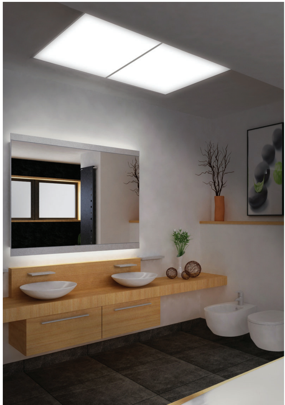
Interior Lighting, Antalya