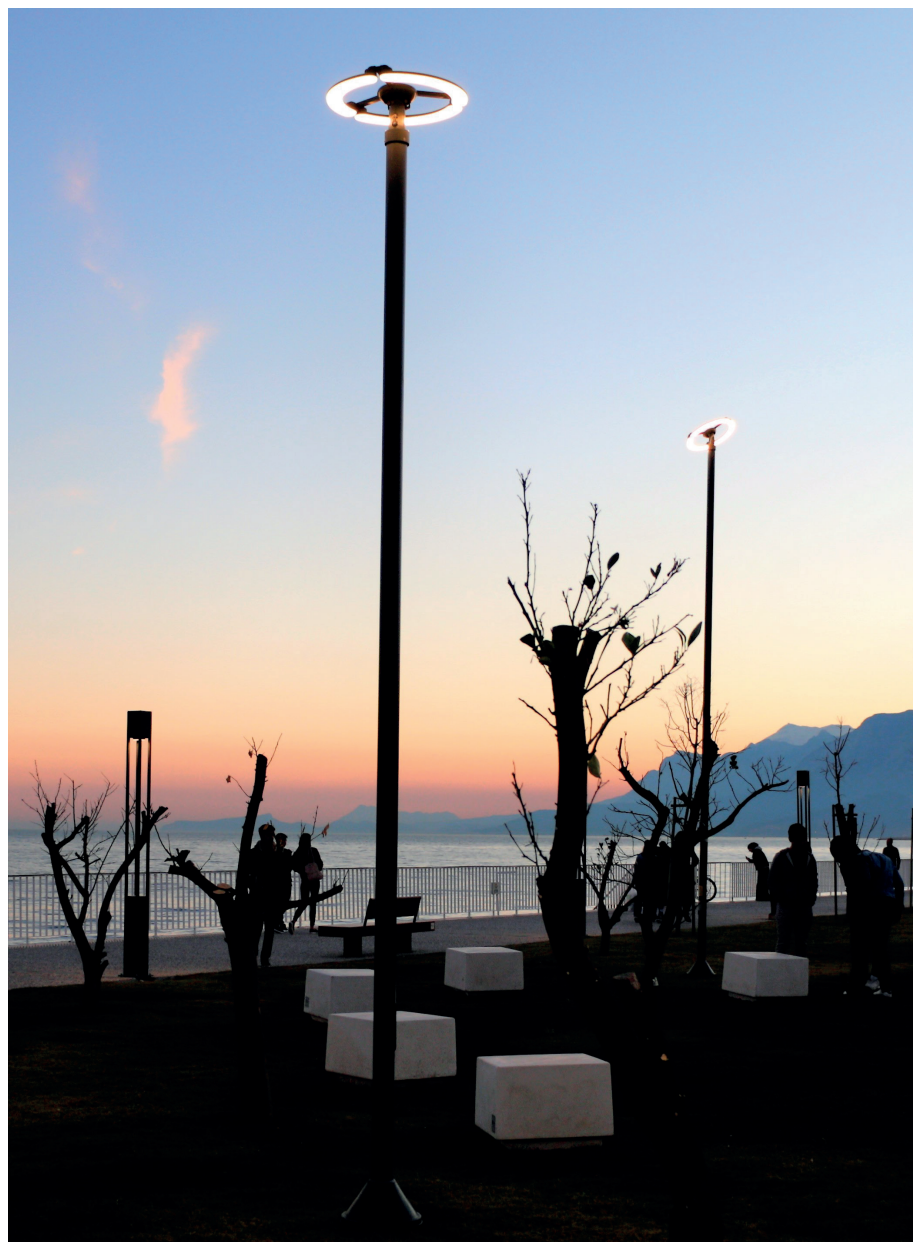
Konyaalti Beach, Antalya