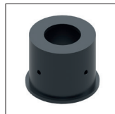
24011271 Mounting Accessory

* Can be mount on Ø60mm pole with mounting accessory