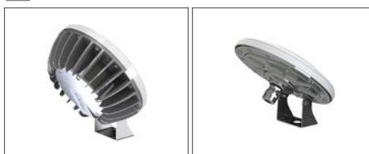
09: Aluminum Body - IP67 10: Chrome Body - IP68

*Additional underwater cable joint has to be used in need of extra underwater cables.