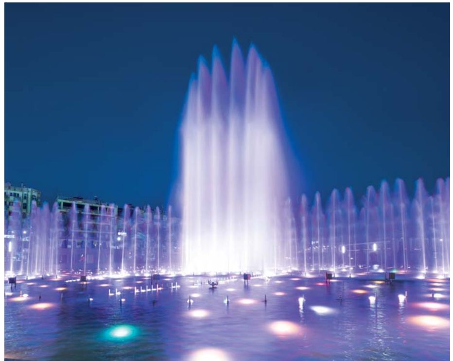
Ornamental Pool, İzmir