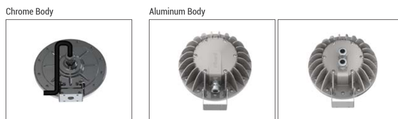
08: Single entry through center 09: Single bottom entry 10: Entry and exit through cover

*Additional underwater cable joint has to be used in need of extra underwater cables.