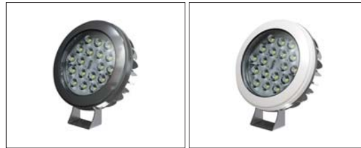
15: Chrome coated spot frame 16: Plastic spot frame in white