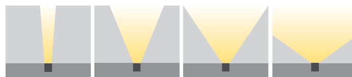
XN: Extra Narrow Angle M: Medium Angle W: Wide angle XW: Without lens