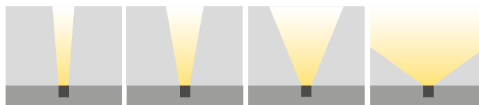
XN: Extra Narrow Angle