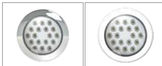
15: Chrome coated