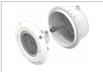
34600134: Mounting Box