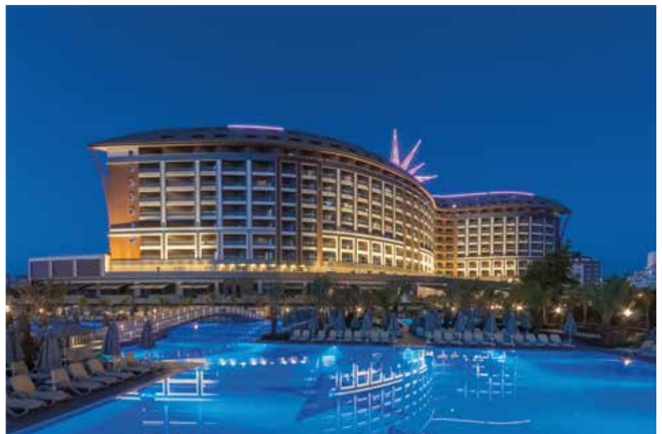
Royal Seginus Hotel, Antalya